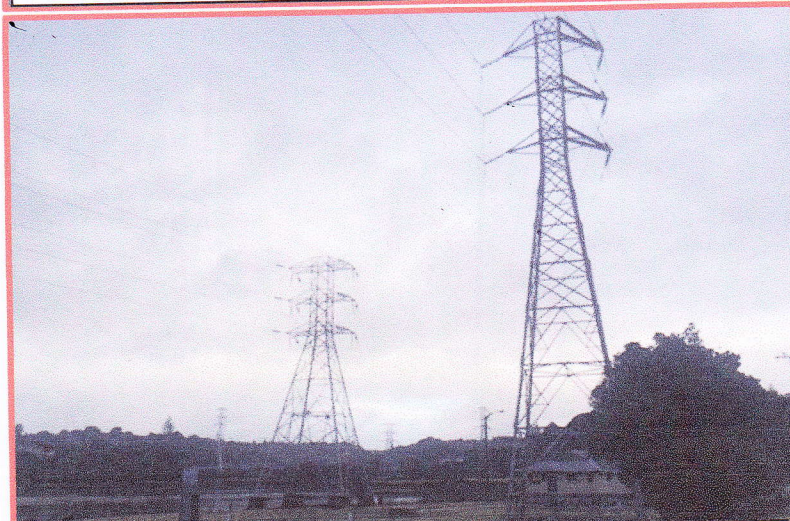
Penrose Mt Roskill & Mangere Mt Roskill transmission lines have been located on foreshore and Onehunga Lagoon in excess of 75 years old