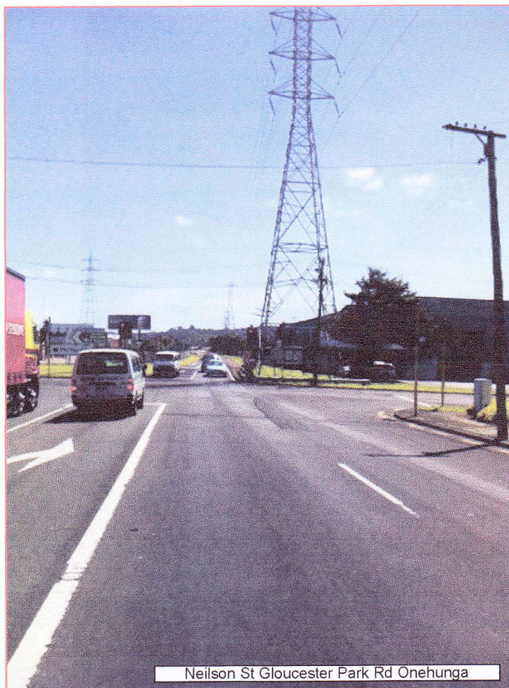
Neilson St Gloucester Park Rd Onehunga

Transmission Lines impact on industrial building design in order to comply with clearance requirements.