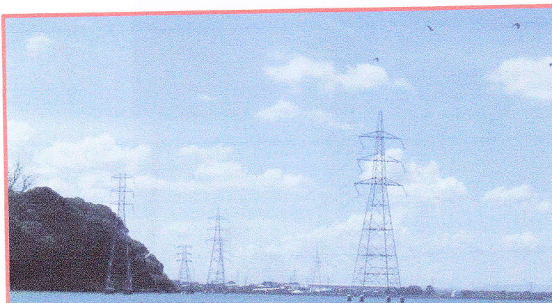
Otahuhu Henderson 220kv Transmission line across Onehunga Bay