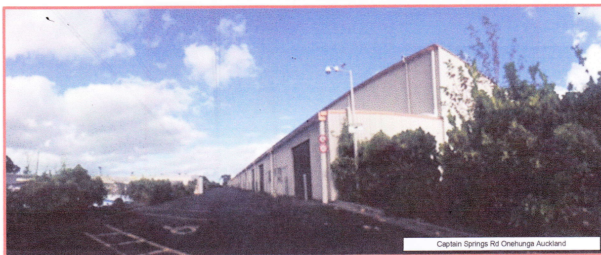
Captain Springs Rd Onehunga Auckland

Transmission Lines impact on industrial building design in order to comply with clearance requirements.